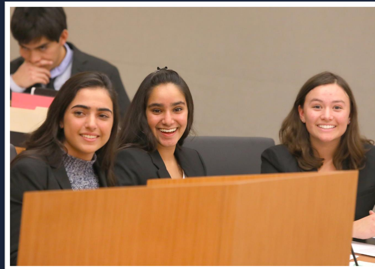
High School Students