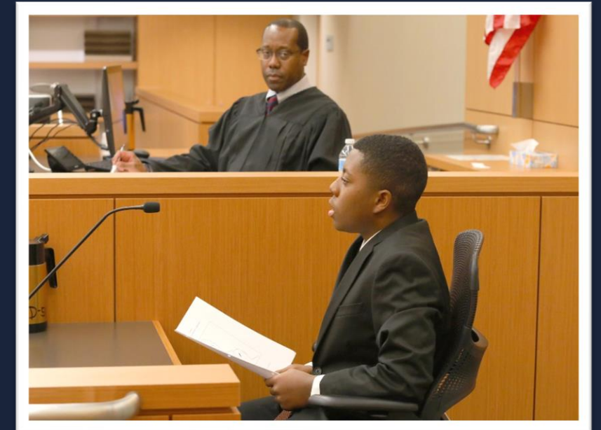
State and Federal Judicial Officers